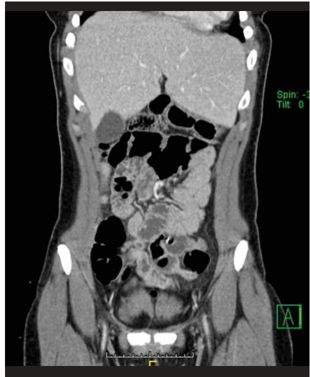
Figure 4. 24 hours after admission. Multislice spiral tomography of the abdomen and pelvis (10/13/2018): Presence of loops with edematous walls and air in the intestines.

Surgical technique: general anesthesia, pneumoperitoneum with Veress at 14 mmHg, umbilical T1, suprapubic T2 and left flank T3. During the intraoperative period, the following were observed: congenital MRI, which determines the medial position of the cecum, absence of the ascending colon, retrocecal appendix with congestive phase. Given the MRI diagnosis due to an incidental finding in the intraoperative period, the clinical outcome or the treatment indicated for AA is not modified, so we proceed to perform laparoscopic appendectomy under the usual techniques. After the surgical intervention, he went to recovery, with