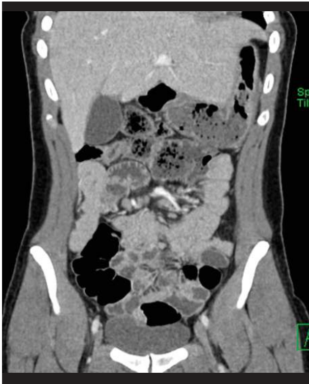
Figure 3. 24 hours after admission. Multislice spiral tomography of the abdomen and pelvis, presence of air in the intestines in the right iliac fossa and pancreas.

Subsequently, with the abdomen's multislice spiral tomography pelvis's help, imaging studies that were not conclusive and given the persistence of the symptoms of intensity abdominal pain in the right iliac fossa (9/10). Positive McBurney sign; acute abdominal pain syndrome problems were raised, with a possible point of appendicular origin.