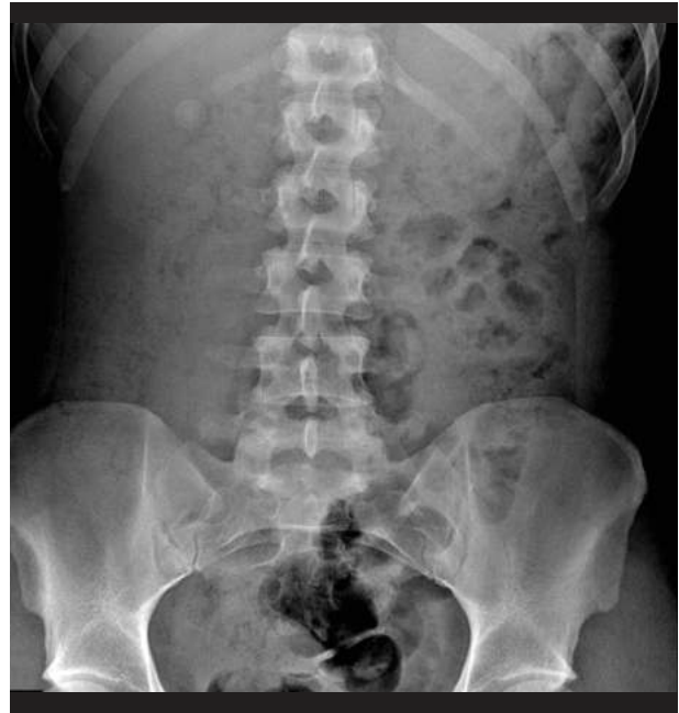
Figure 2. Plain standing abdominal X-ray. Shadow of the intra-abdominal organs of normal shape and position.

Laboratory tests: blood group A negative. Urine Exam: Not pathological. Serologic: HCG - beta subunit (quantitative), blood culture, urine culture, Hepatitis B antigen, HIV I - II (ELISA), and VDRL negative.