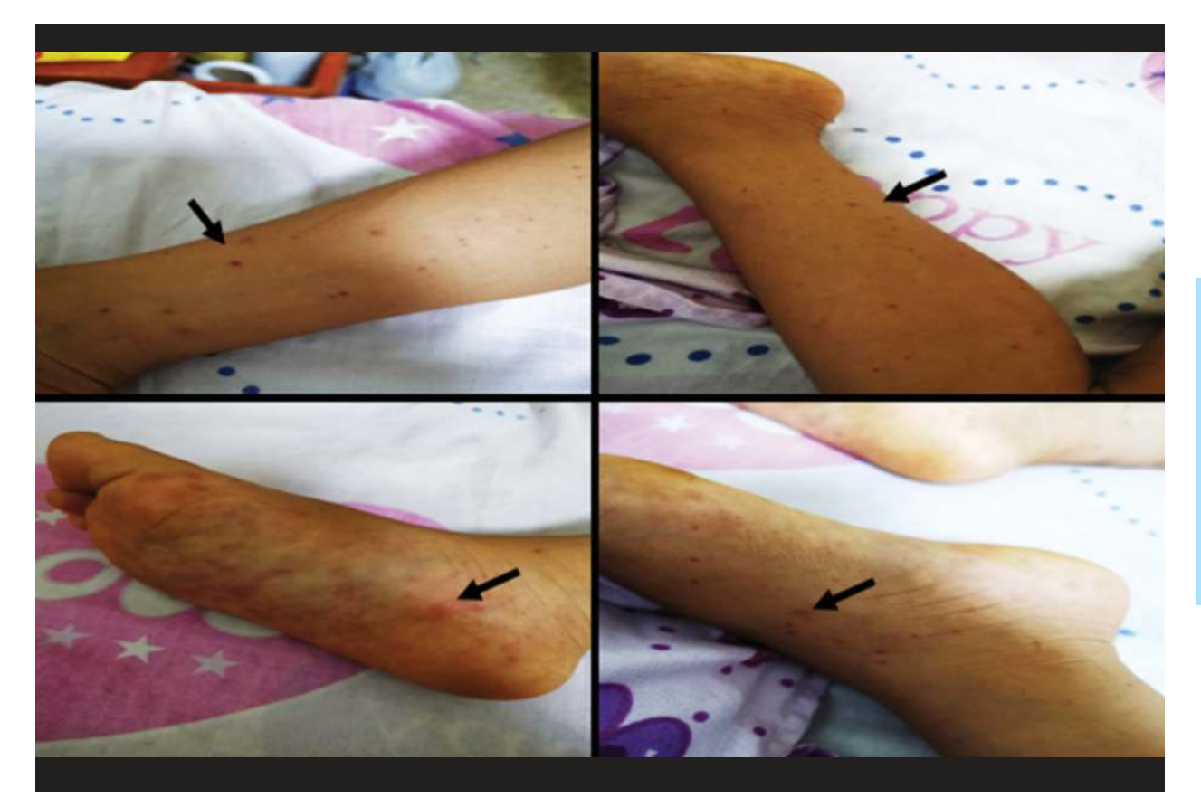
Figure 1. Upon admission, purpuric lesions in remission, generalized and predominantly of the lower limbs and plantar region of both feet.