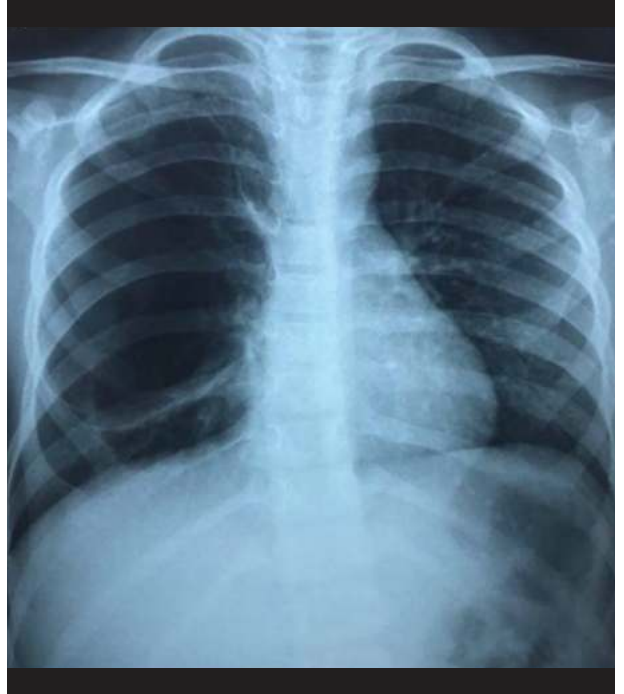
Figure 2. Anteroposterior chest radiograph: cystic image and right atelectasis.