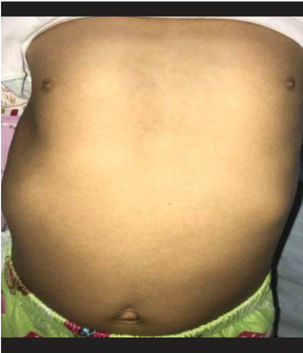
Figure 1. Asymmetry of right chest.