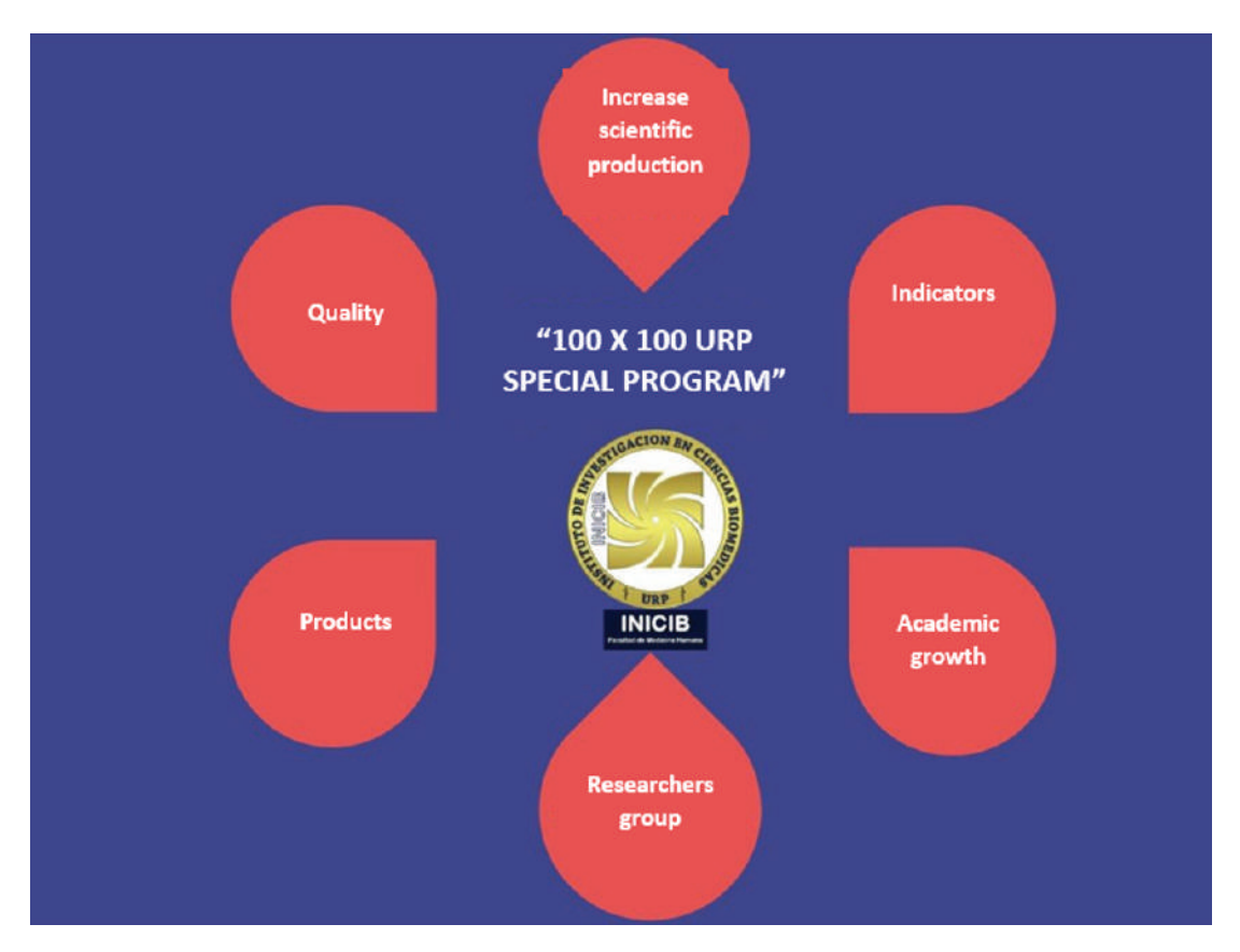
Figure 2. 100 x 100 URP Special Program

In the 2021, until the first half of June, only in SCOPUS, 32 publications of the Universidad Ricardo Palma were registered.