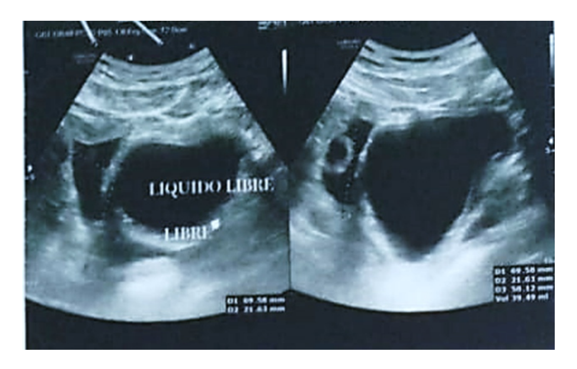
Figure 1. Presence of free fluid in the pelvic area measuring approximately 10 mm.