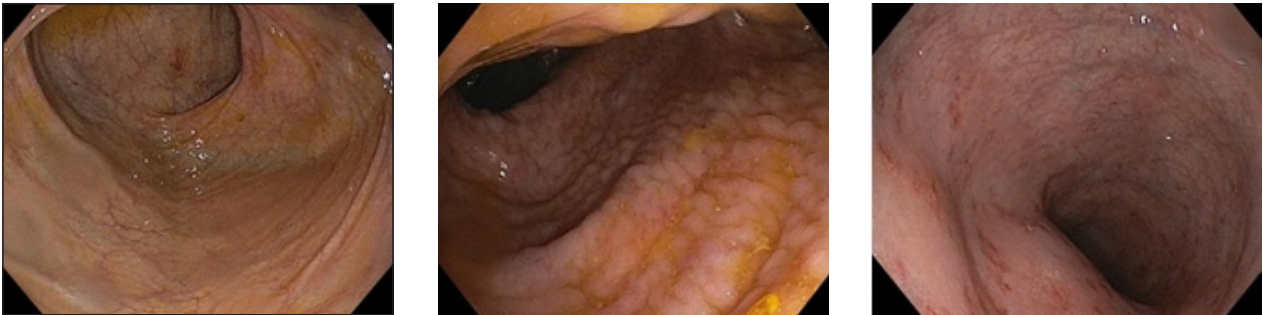
Figure 2a. Transverse colon. b.- sigmoid colon. C.- Rectum

diagnosis of ulcerative colitis causing toxic megacolon was made.