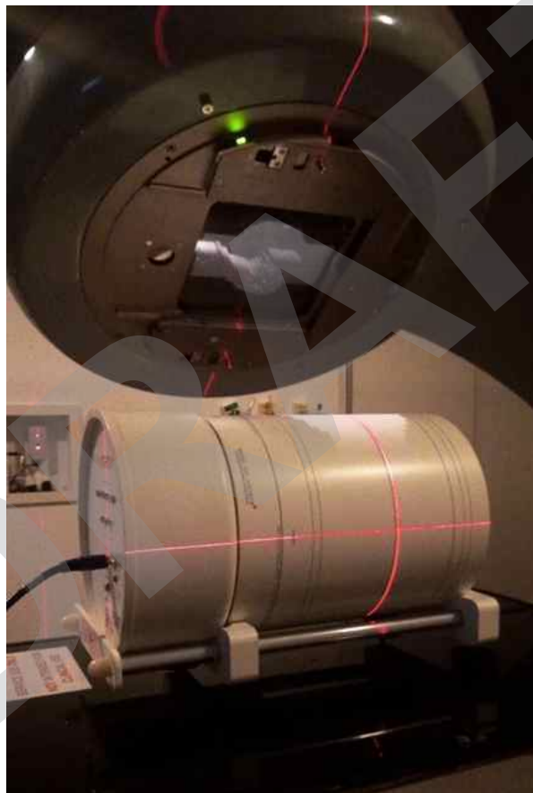
Figure 2. Positioning of the ArcCheck for the reproduction of a dynamic arc planning.

For the dose distributions, the parameters of the treatment plans were exported and experimentally simulated by the ArcCheck diode array. In conjunction with ArcCheck, the SNC Patient™ software projects the measurement onto the cylindrical surface into a plane and displays it similarly to a flat (2D) matrix, which can be reconstructed into a three-dimensional matrix (13-15) .