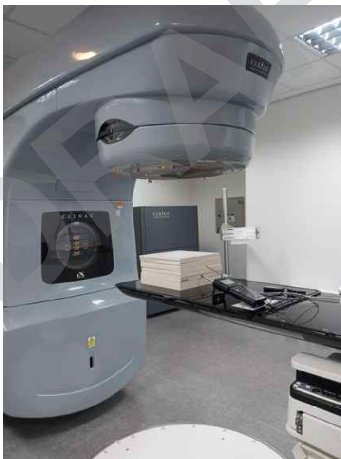
Figure 1. Positioning of the ionization chamber in the solid water phantom.

The computerized treatment planning system (TPS) used was Eclipse version 15.5 (Varian Medical Systems, Palo Alto, CA, USA).