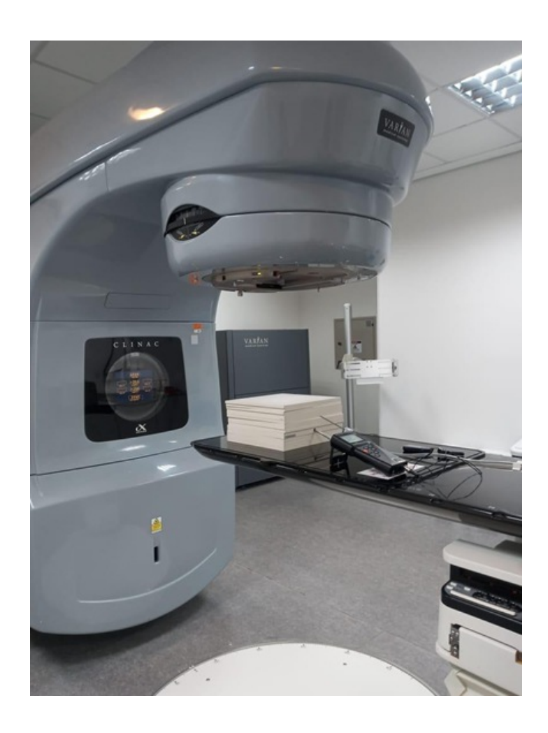
Figure 1. Positioning of the ionization chamber in the solid water phantom.

The computerized treatment planning system (TPS) used was Eclipse version 15.5 (Varian Medical Systems, Palo Alto, CA, USA).