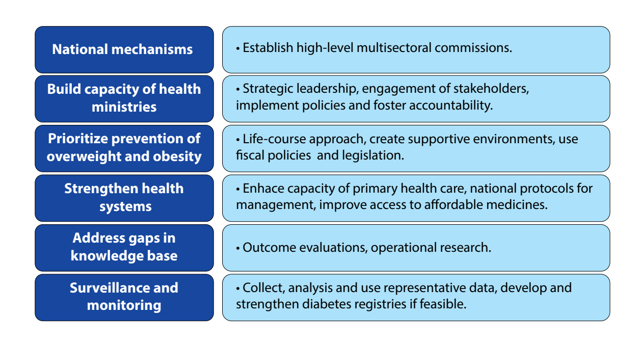
Figure 1. National strategies, however, must be coupled with individual lifestyle recommendations and prevention methods in order to decrease DM rates around the world.

As one of the four major non-communicable diseases (NCDs), DM has attracted a great deal of attention from global health authorities. In fact, the WHO has developed a strategy to address increasing rates of DM including prevention, management, access to essential medicines, and surveillance. Furthermore, the WHO (2016) has developed global systemic recommendations (Figure 1) designed to improve national capacity for prevention and control of DM<sup>2</sup>.