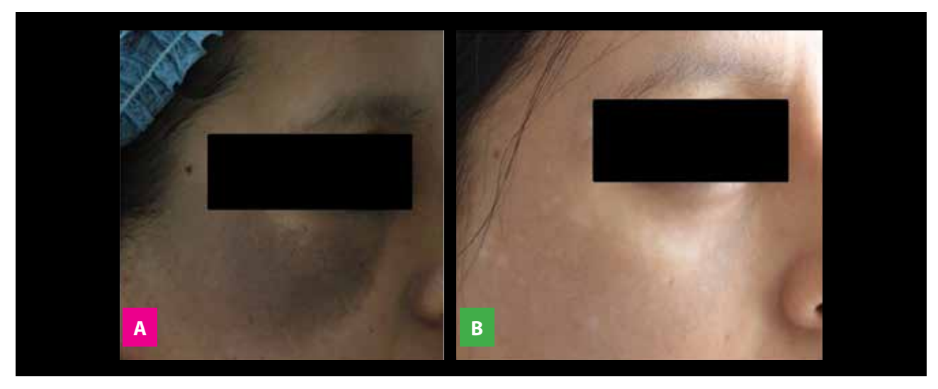
Figure 2. 22 years old female. The frequency of their sessions was 60 days and they were performed 10 sessions in total. It presented side effects of hypopigmentation. He did not need depigmenting. A) Before and B) after treatment.