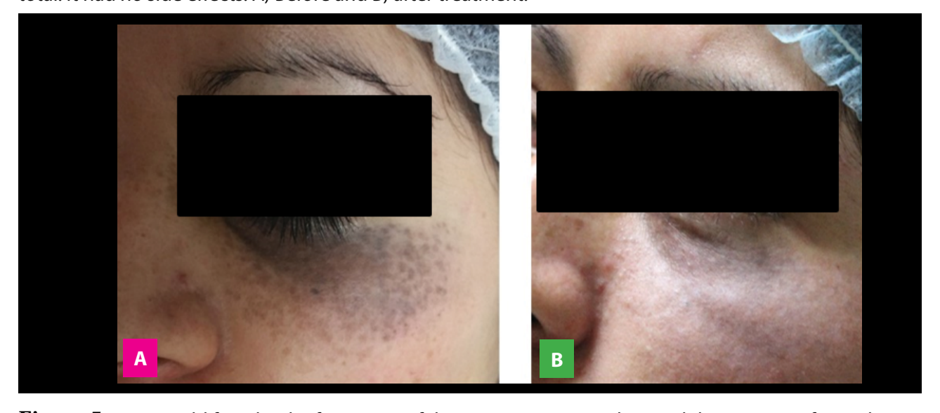
Figure 5. 18 year old female. The frequency of their sessions was 30 days and they were performed 9 sessions in total. It had no side effects. A) Before and B) after treatment.