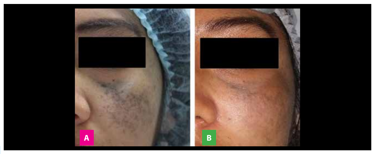
Figure 3. Woman 32 years old. The frequency of his sessions was 60 days and there were 8 sessions in total. It presented side effects of post inflammatory pigmentation and needed depigmenting between sessions. A) Before and B) after treatment.