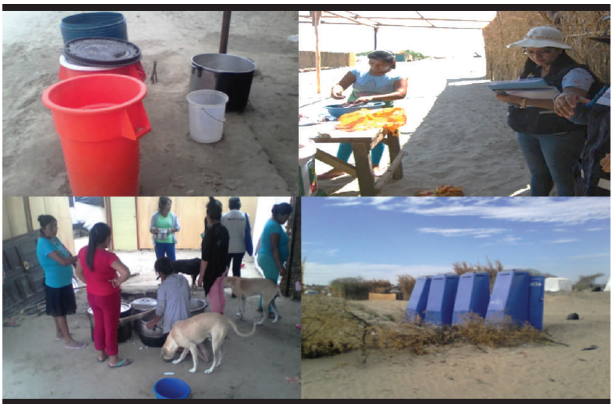
Figure 2. Risk factors in the presence of shelter illnesses. Piura 2017.