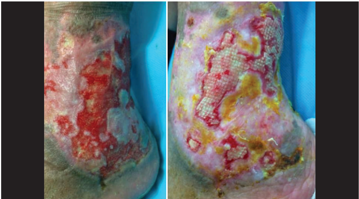
Figure 4. Photograph of the initial healing progress 7 days after starting the treatment, where residual areas of lesion in progress of resolution can be seen, with epithelialization areas.

The lesion progresses favorably until the 4th week, obtaining 95% healing and leaving a residual lesion in the internal malleolus region with characteristics similar to those described in the initial process 3 years ago, without further progress.