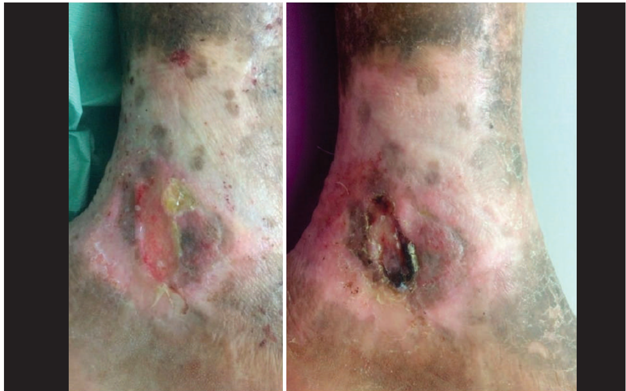
Figure 6. After 3 months of treatment, a scarring of the vascular ulcer is observed.

A total closure of the lesion is achieved after 3 months from the start of treatment with the autologous serum.