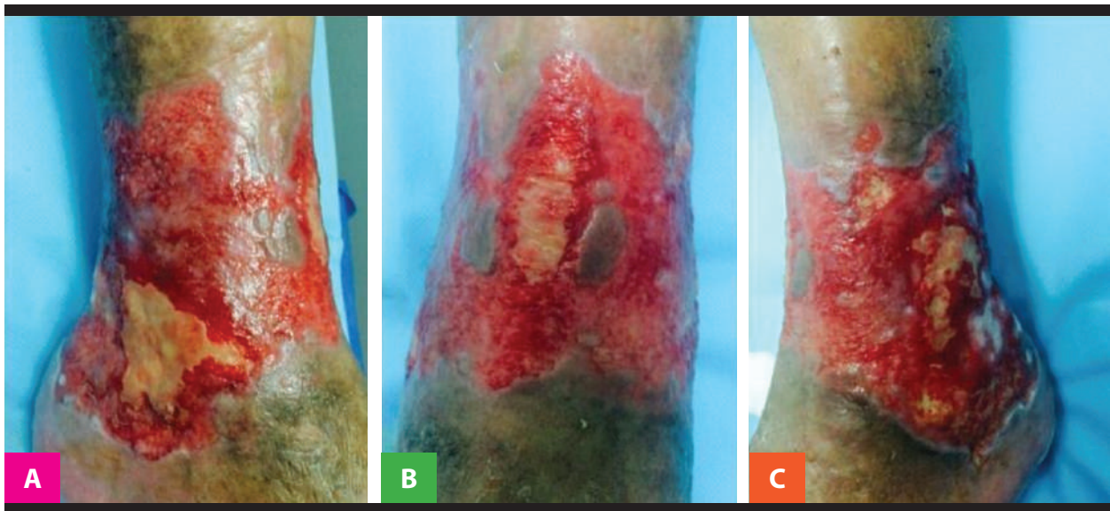
Figure 1. 24 hours after starting therapy, where an immediate response to the initial healing process is observed. A) View of the inner of the left leg B) Anterior view of the distal portion of the left leg, and C) View of the outer of the left leg.

Physical examination revealed a lesion measuring approximately 10x15 cm, extending from the medial malleolus to the external malleolus in a surrounding manner. It is covered with a hydrocolloid dressing, with 80% granulation tissue, serohematic secretion, signs of maceration and foul odor, irregular borders, erythema and surrounding edema. Distal pulse present and pain of 5/10 according to visual analogue scale.