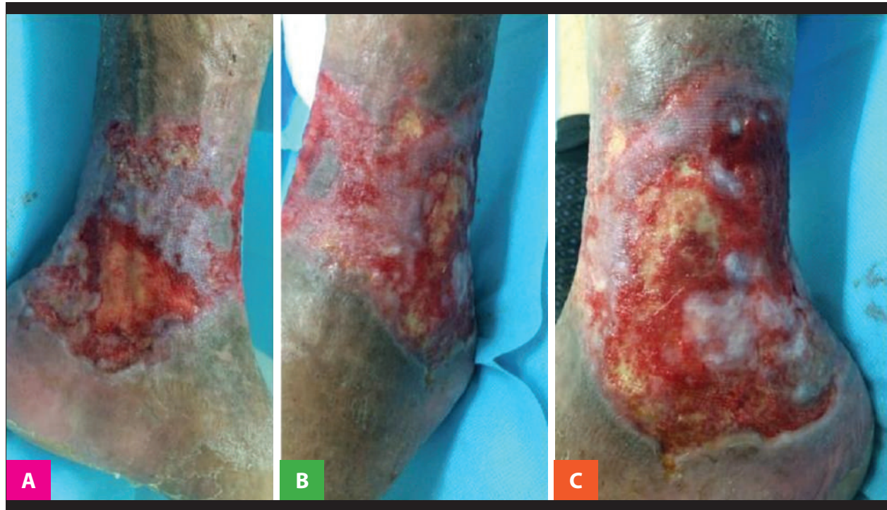
Figure 2. 24 hours after starting therapy, where an immediate response to the initial healing process is observed. A) View of the inner of the left leg B) Anterior view of the distal portion of the left leg, and C) View of the outer of the left leg.

At 24 hours, the occlusive patch was opened and a reduction of the bloody bed was evidenced, areas with the presence of macerated tissue and a velvety appearance, with the appearance of dermal buttons (view photo).