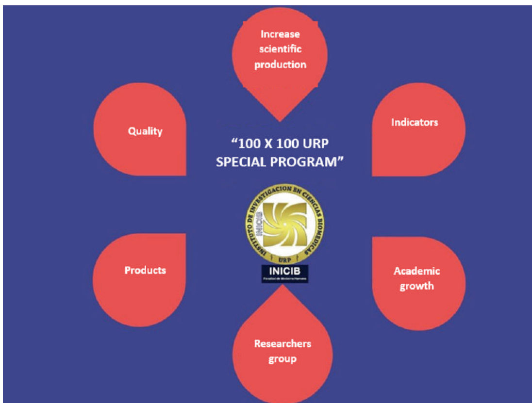
Figure 2. 100 x 100 URP Special Program