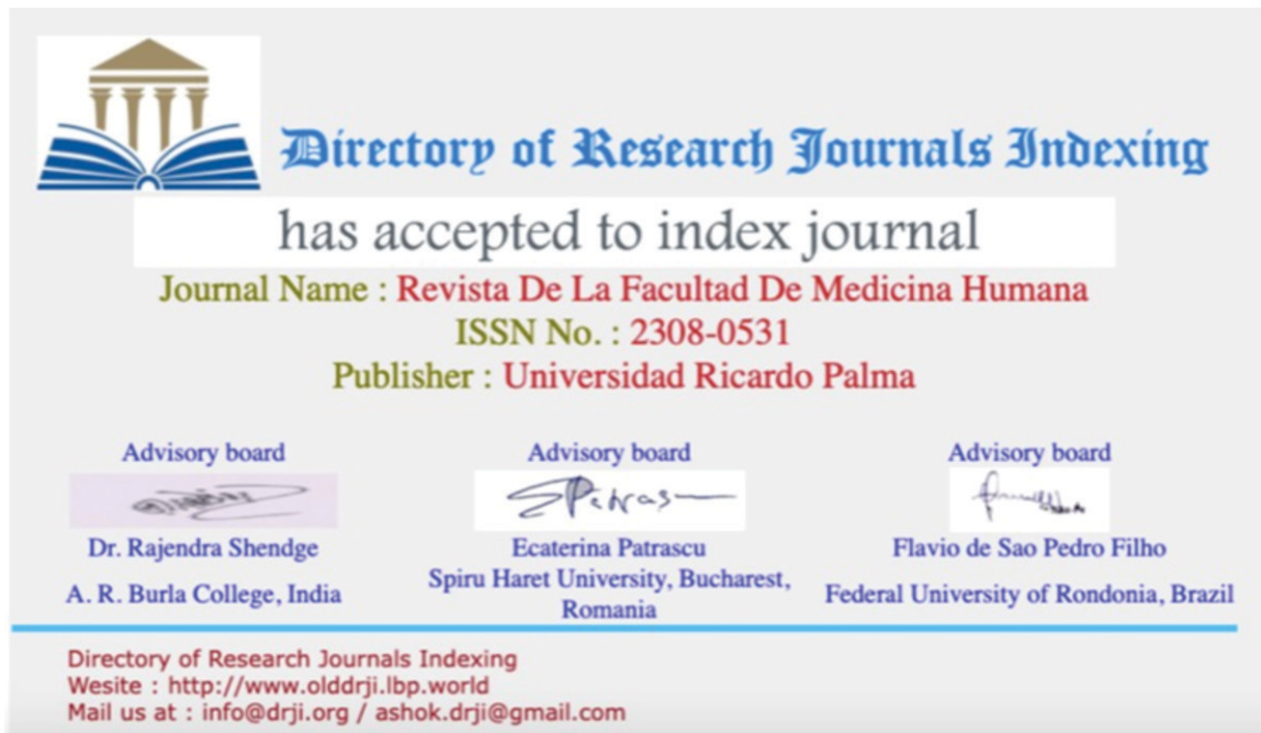
Figure 2. Recognition given by Directory of Research Journals Indexing to the Revista de la Facultad de Medicina Humana de la Universidad Ricardo Palma for its acceptance as an indexed journal.

Additionally, it is satisfying to emphasize that the RFMH has been indexed in the EMBASE database since 2020. EMBASE is a tool of great prestige and highly valued by academics and researchers since it specializes in the biomedical field and is used to access levels highest levels of scientific evidence in systematic reviews and meta-analyses. By being in EMBASE, the RFMH is positioned on a platform that facilitates the search for high-quality scientific literature and allows researchers to access its publications more easily when conducting extensive research and seeking reliable sources of evidence. This also means that studies published in the RFMH can be cited more frequently, increasing their impact on the scientific community. It is crucial to note that by being part of EMBASE, the RFMH is associated with a standard of excellence and rigor in biomedical